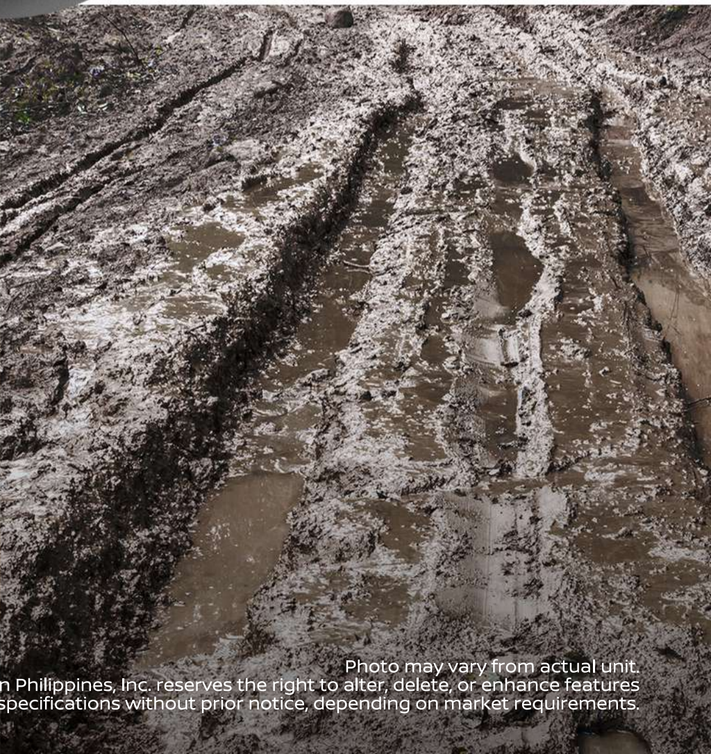
Photo may vary from actual unit. Nissan Philippines, Inc. reserves the right to alter, delete, or enhance features and specifications without prior notice, depending on market requirements.