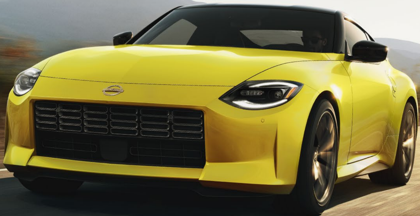
Photo may vary from actual unit. Nissan Philippines, Inc. reserves the right to alter, delete, or enhance features and specifications without prior notice, depending on market requirements.

Trends come and go, but some things never go out of style. The Nissan Z is an icon redesigned for the modern era of excitement, with an exterior that pays homage to previous Z models, an array of Nissan Intelligent Mobility technology, and the exhilaration of a V6 Twin-Turbo engine.