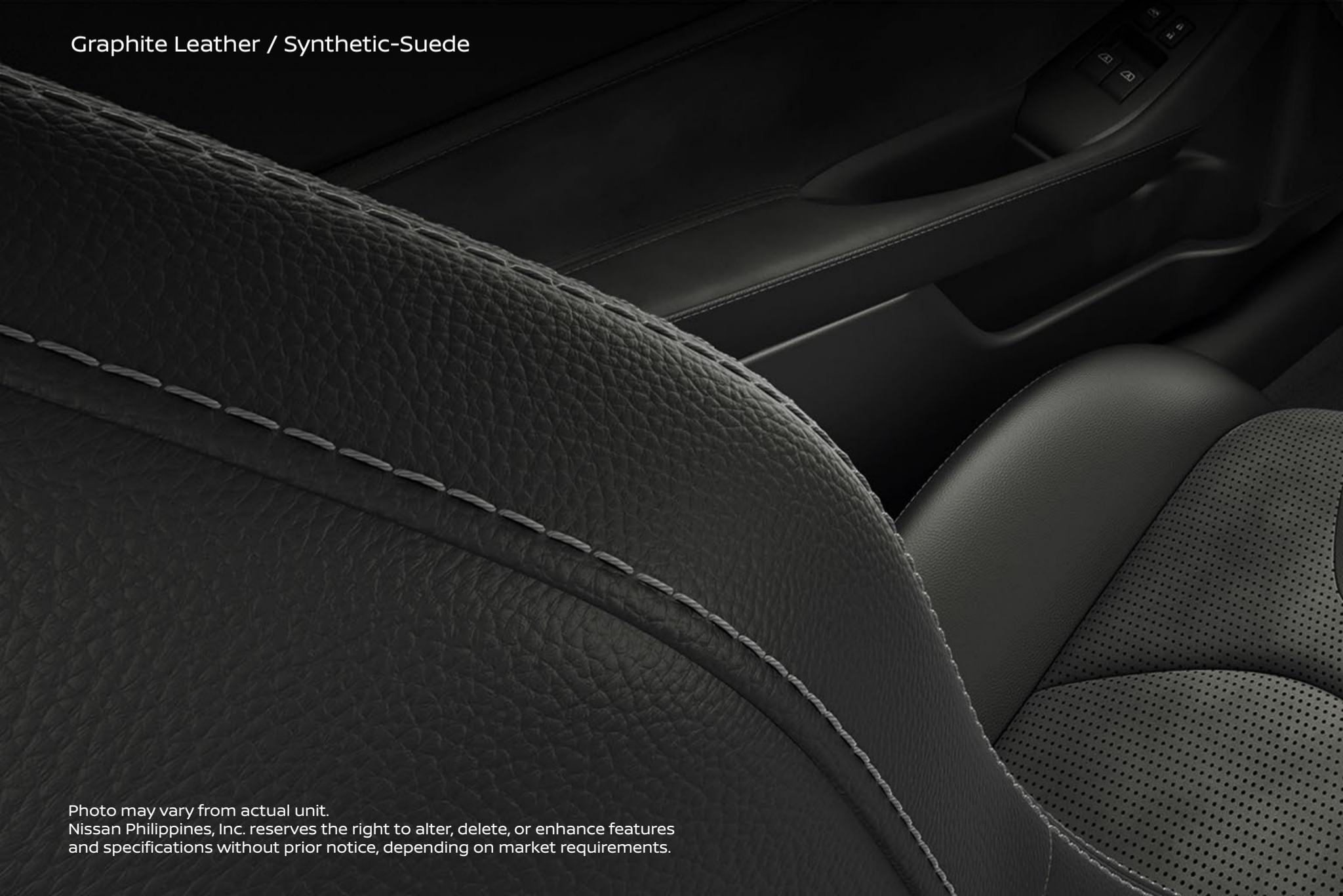
Photo may vary from actual unit. Nissan Philippines, Inc. reserves the right to alter, delete, or enhance features and specifications without prior notice, depending on market requirements.