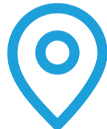
My Car Finder