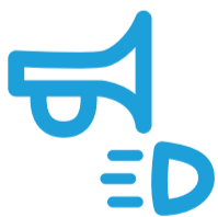
Remote Horn and Lights