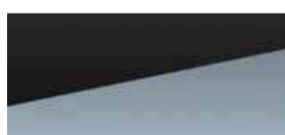
Moon Pearl Gray with Black Roof 2

Nissan Philippines, Inc. reserves the right to alter, delete, or enhance features and specifications without prior notice depending on market requirements.