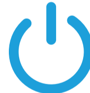
Remote Engine Start / Stop