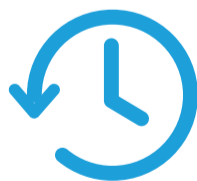
Driving and Journey History