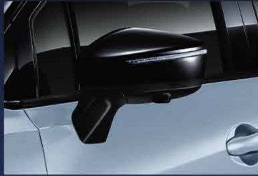
Black Finish Outside Door Mirrors***