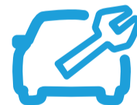
Maintenance Alert and Reminder