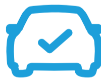
Vehicle Health Report