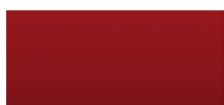
Cayenne Red 3