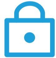
Remote Lock / Unlock