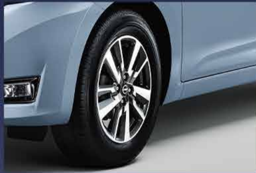
New 16" Alloy Wheel Design*