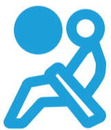
Automatic Collision Notification